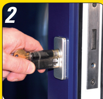
2 Remove existing cylinder