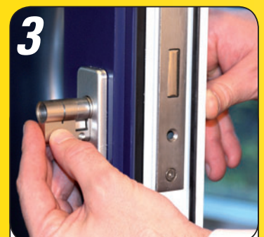
3 Fit new ePAC Mechanical Cylinder into existing mortice casing