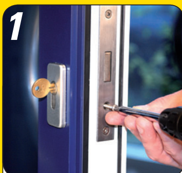
1 Remove existing cylinder retainer screw from the mortice lock