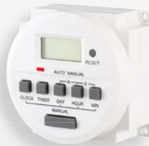
TH82712V Snap-on digital clock See page 301.