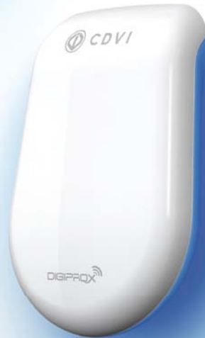
[C] WHITE VERSION: SOLARPW BLACK VERSION: SOLARPB