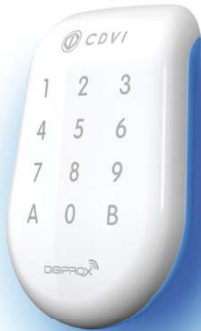
[D] WHITE VERSION: SOLARKPW BLACK VERSION: SOLARKPB