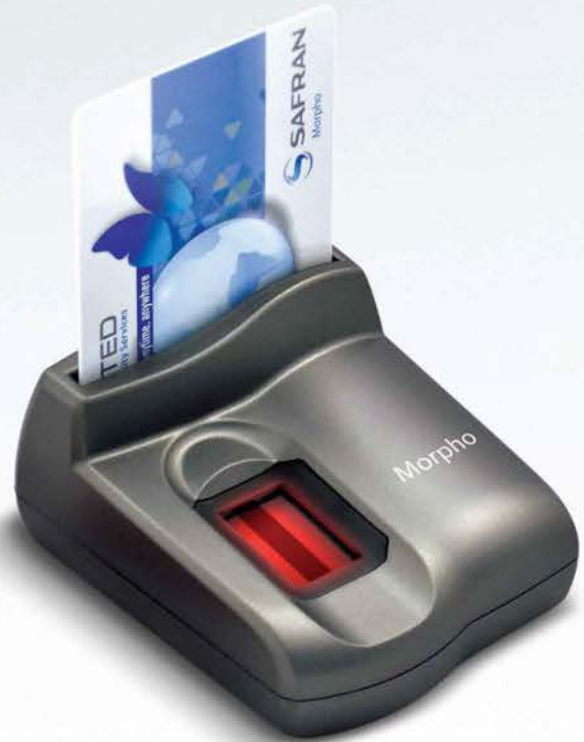
MSO 1350 / MSO 1350 E2