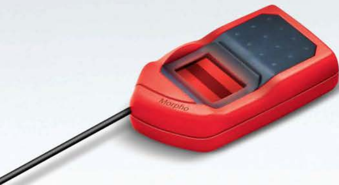
MSO 1300 / MSO 1300 E2

The MorphoSmart™ 1300 Series offers a reliable, ergonomic and cost-effective solution for enrollment, identity verification and user identification. Their match-on-device or match-on-card functions guarantee the faultless protection of information and the security of desktop applications.