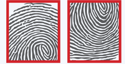
Placement variations on smaller sensors

MSO 1300 Series capture surface (14x22mm) ensures that the richest area on fingerprints is systematically captured time after time. Acquisition surface area contributes significantly to the overall biometric performance: