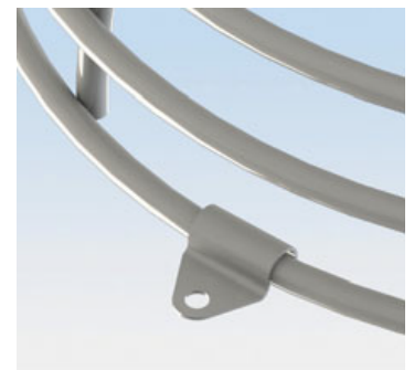
Supplied with heavy duty easy install quick fit clamps and screws

In partnership with SIGMA FIRE & SECURITY