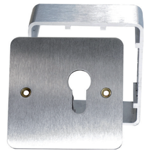
Euro profile keyswitch