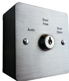
Digiway Plus keyswitch