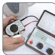
Class II insulation