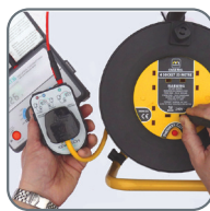
Extension lead testing