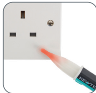
Non contact voltage detection