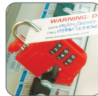
Fits most toggle switch MCBs and main switches