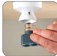
Plug in Lightmate