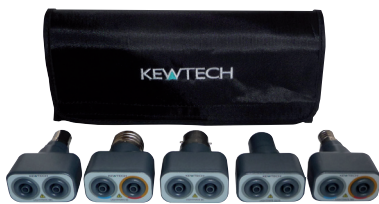
Lightmates (BC, ES, GU10, SBC & SES)