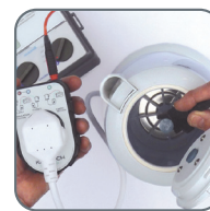
Class I earth bond