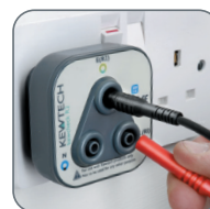
For ring mains testing