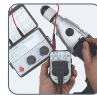
Class I insulation