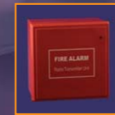
EDA-T6000 Radio I/O Unit

See Associated data-sheets for full equipment specification www.electrodetectors.co.uk/data-sheets Only a small selection of devices are shown. For the complete range and for a full specification please visit our website.