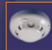
EDA-R5000 Smoke Detector