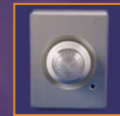
EDA-A6030 Sounder/LED Strobe