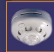
EDA-R6030 Smoke Detector/Sounder and Beacon