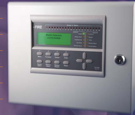
20 Zone Panel pictured. 8 and 100 Zones Available.