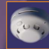
EDA-R6000 Smoke Detector/Sounder