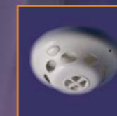
EDA-D5000 Heat Detector