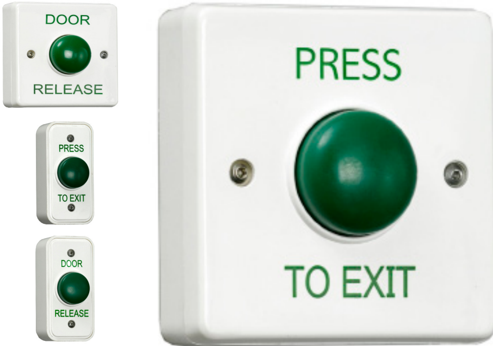
Plastic Green Dome Button