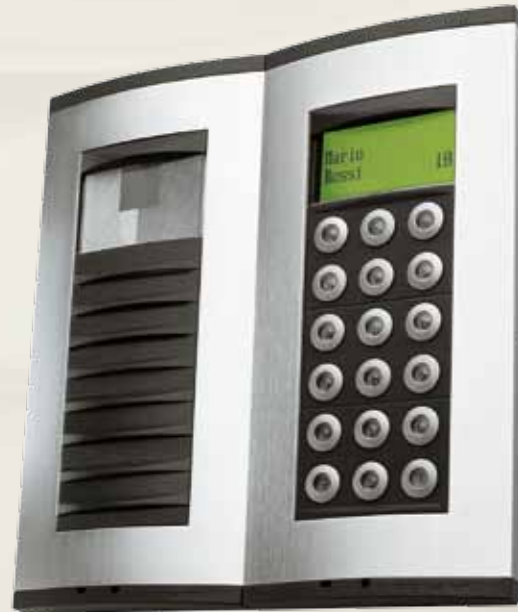
HSV/0ST & HAC/200