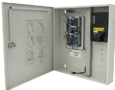
All panels are supplied in a durable metal case which includes an integrated 6 AMP 12V DC PSU