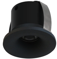
MATT ANTHRACITE GREY PRODUCT CODE: CHLOE-BZL-GREY