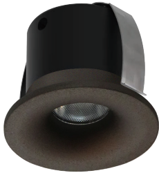
BRONZE PRODUCT CODE: CHLOE-BZL-BRZ

FOLLOWING BEZEL RANGE IS ONLY SUITABLE FOR INDOOR & BATHROOM USAGE ( SOLD SEPARATELY )