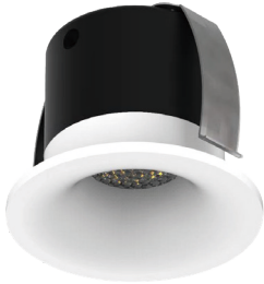
MATT WHITE (PAINTABLE BEZEL)