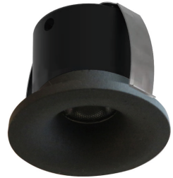
MATT BLACK PRODUCT CODE: CHLOE-BZL-BLK

FOLLOWING BEZEL RANGE IS ONLY SUITABLE FOR INDOOR & BATHROOM USAGE ( SOLD SEPARATELY )