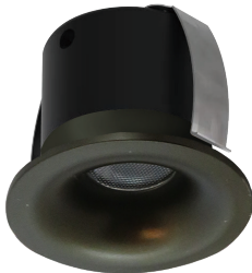
ANTIQUe BRASS PRODUCT CODE: CHLOE-BZL-AB