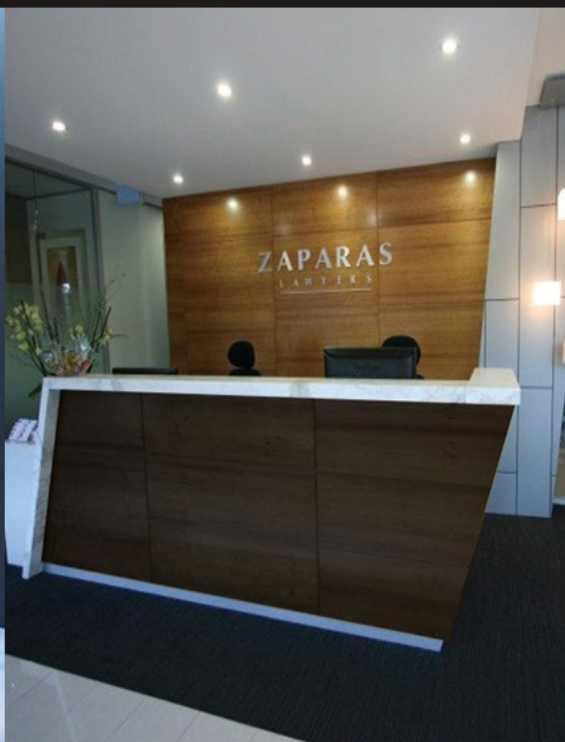
ACCENT/ WALL WASH