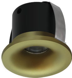
POLISHED BRASS PRODUCT CODE: CHLOE-BZL-PB