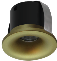
MATT GOLD PRODUCT CODE: CHLOE-BZL-MG