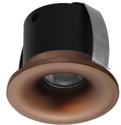
POLISHED COPPER PRODUCT CODE: CHLOE-BZL-PC