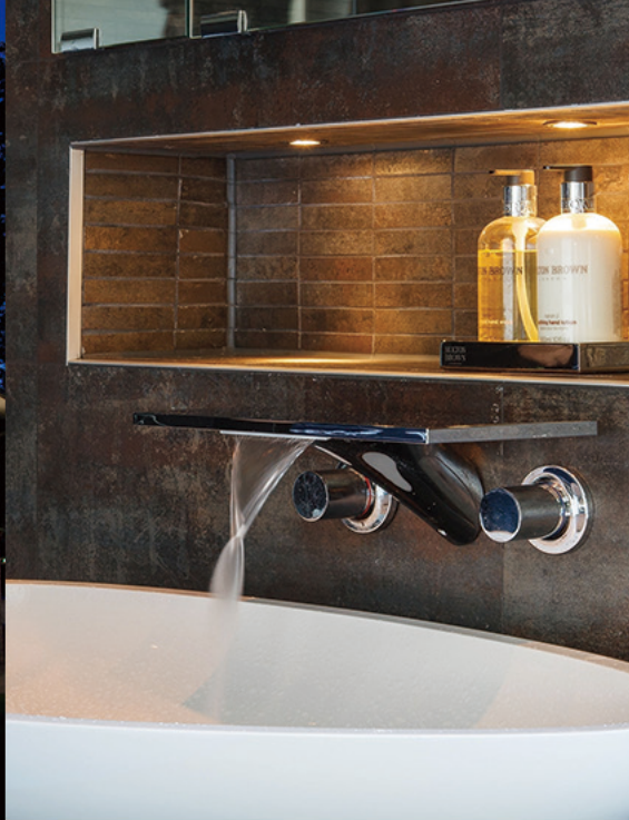
ALCOVE / NICHE LIGHTING