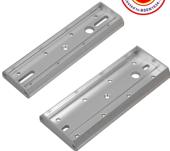
AH600 / AH1200