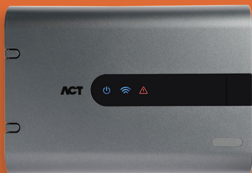
ACTpro eLock Hub