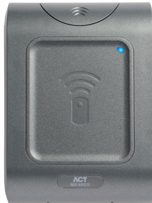
Product Code ACTpro MF 1040e