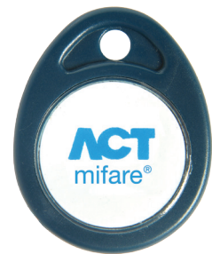
Product Code ACTpro MF Fob