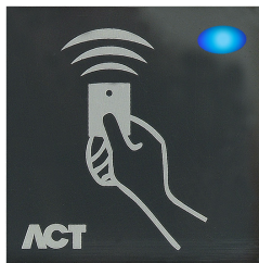
Product Code ACTpro MF 1030PM