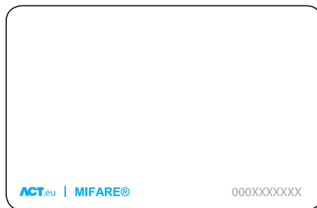
Product Code ACTpro MF Card