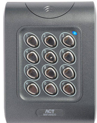
Product Code ACTpro MF 1050e

Surface/Flush Mount PIN & Proximity Reader