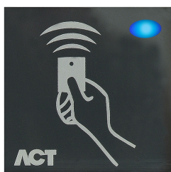
Product Code ACTpro EV1 1030PM Panel Mount Proximity Reader