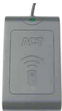
Product Code ACTpro USB Reader USB DESFire EV1 Reader (also compatible with MIFARE CLASSIC & ACT RFID)