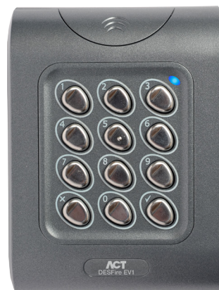
Product Code ACTpro EV1 1050e Surface/Flush Mount PIN & Proximity Reader