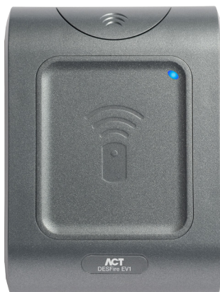
Product Code ACTpro EV1 1040e Surface/Flush Mount Proximity Reader