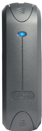
Product Code ACTpro EV1 1030e Mullion Proximity Reader