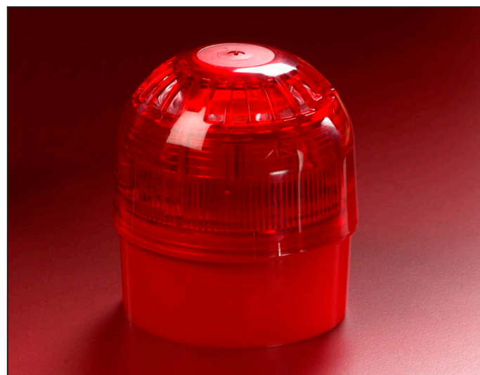
Part no 58000-005 (red base and lens)