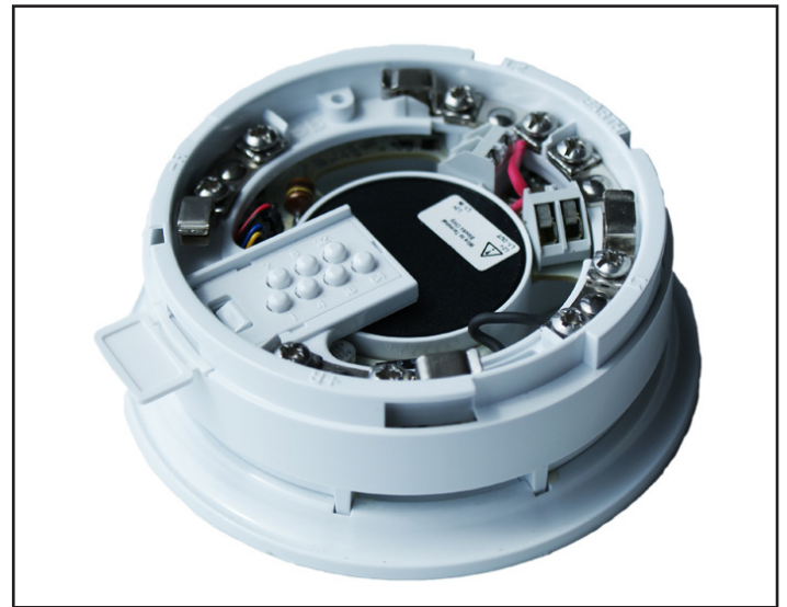
Part no 45681-702 - Discovery Sounder Base