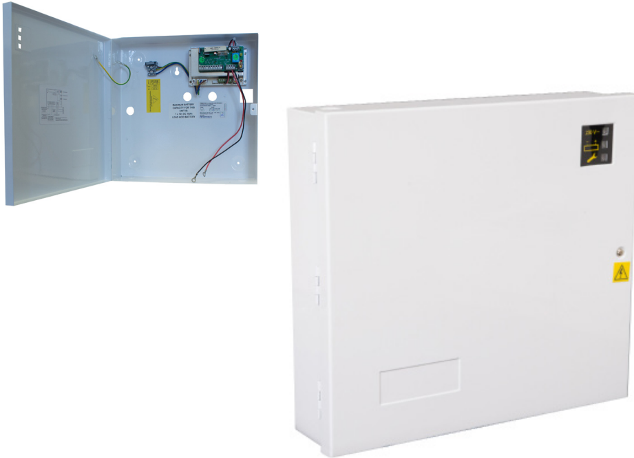
12 & 24v Monitored Power Supplies