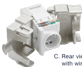
C. Rear view of Keystone with wire cap attached