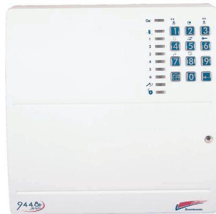
9448EUR-90 (on board keypad)