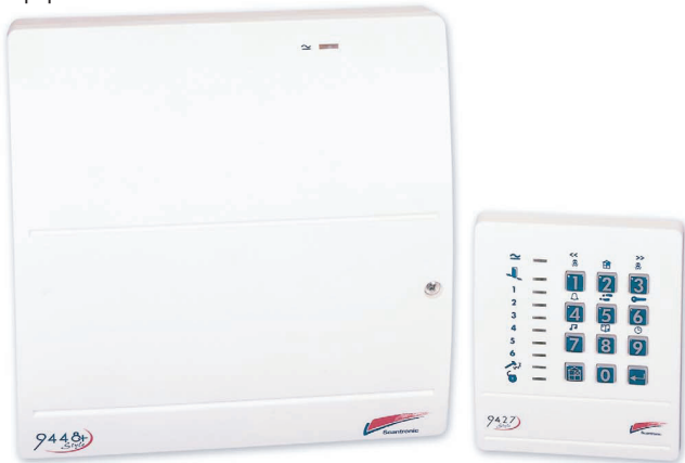
9448EUR-95 (remote keypad)